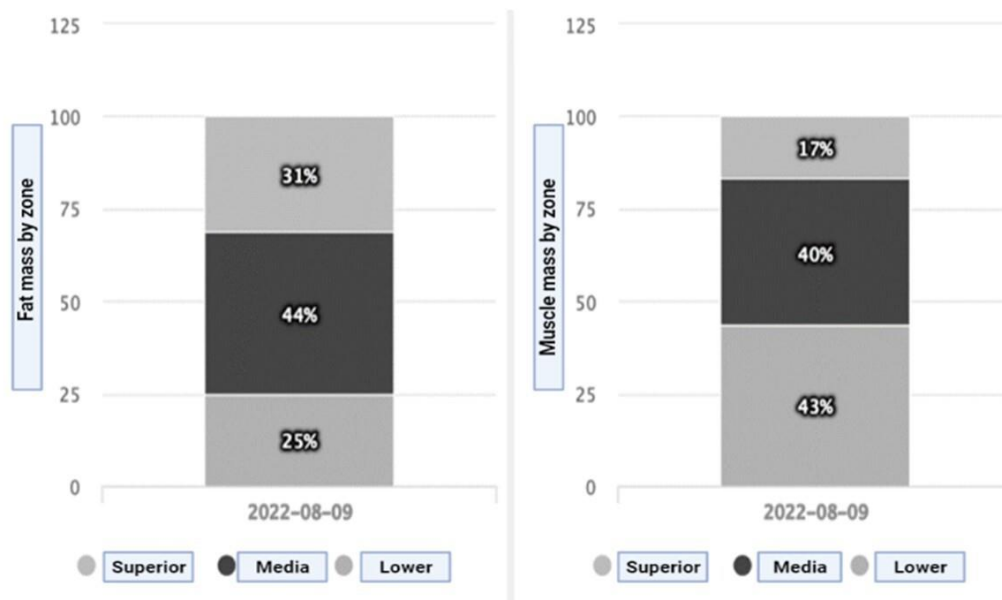
Figure 3. Distribution of adipose and muscle mass by zones.